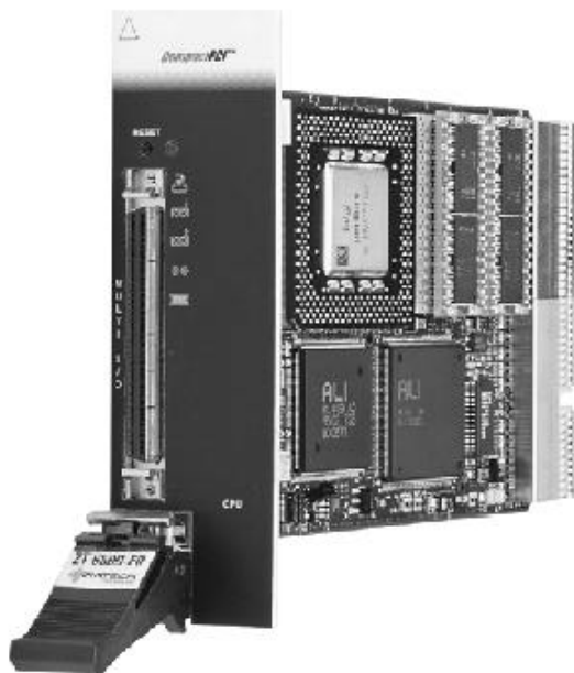
Figure 2: Ziatech ZT-6500 3U Compact PCI Pentium Board.