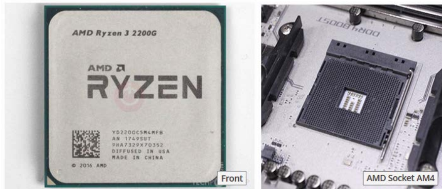
Figure 1. Processor as depicted on TechPowerUp.com